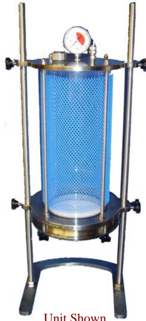
Unit Shown Model 43T Pyrex®